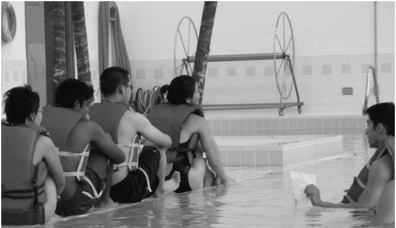
Learning to become a lifeguard or a swimming instructor is a very rewarding experience and makes for a great career!

Requests for refunds due to program cancellation from an Aquatic Leadership Course must be received in writing a minimum of five business days prior to the program start date. Customers cannot register for these courses once the program has begun, therefore, this time is required to contact persons on the waitlist to fill the space.